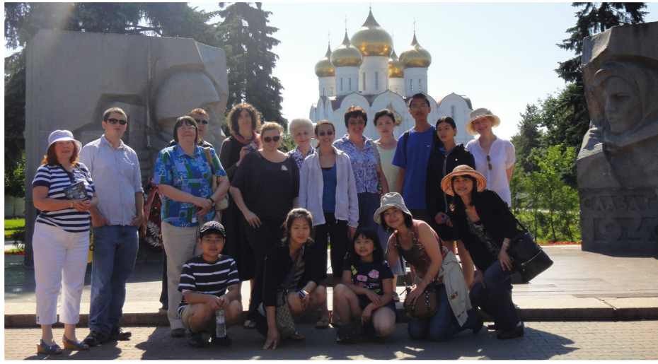
The American Fine Arts Festival Summer Music Courses in Russia. The participants next to the WWII Monument in Yaroslavl.